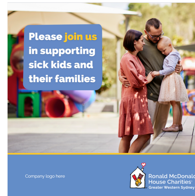
Social media tiles