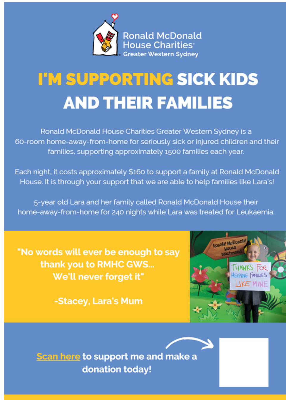
Personalised Fundraising posters